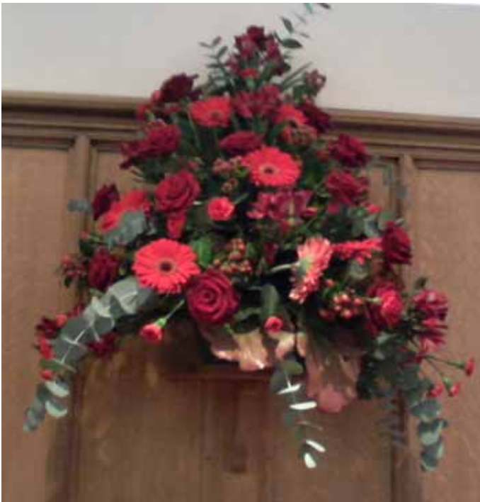
Flowers in the Sanctuary on Remembrance Sunday, 11th November 2012