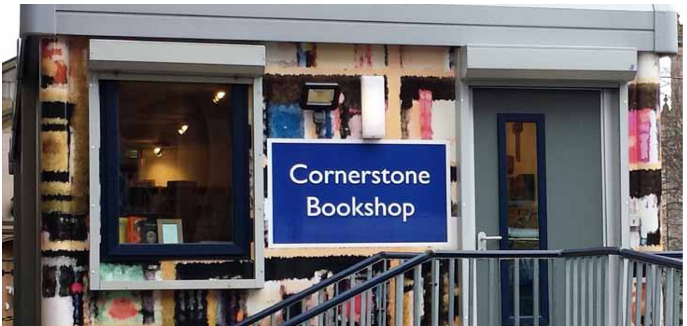
The Cornerstone Bookshop has moved up meantime onto St John's Terrace