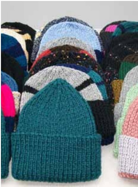
A sample of the Work Party hats

So where do the chickens come in? One day we visited a rural church to see a partly built manse that they want us to complete. We were received very warmly by about 40 people. They presented us with bananas, garlic, cloth, a cake and a live chicken each! It was a humbling experience showing a spirit of generosity towards visitors. As we left we loaded the chickens, and our other gifts, into the truck (we ate the cake). Later we gave a lift to three men travelling to the Assembly. They went in the back of the truck with the chickens! I did not see the birds after we got back to Nampula. Maybe they went into the pot for the Assembly lunches. I hope to go back in 18 months or so to see how they are getting on and we expect to welcome some of their leaders here soon.