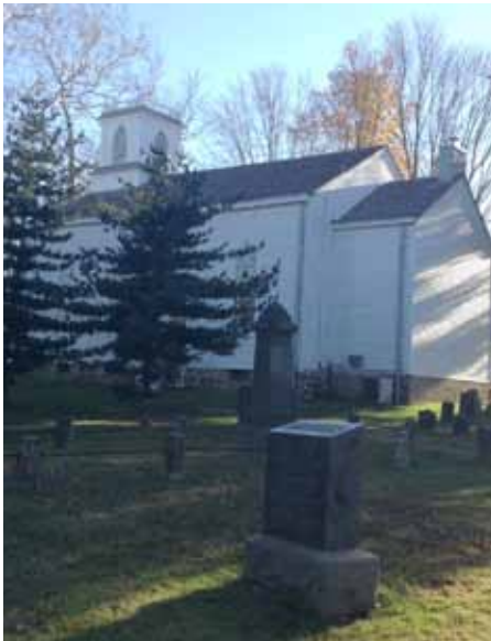
The Church at New Vernon