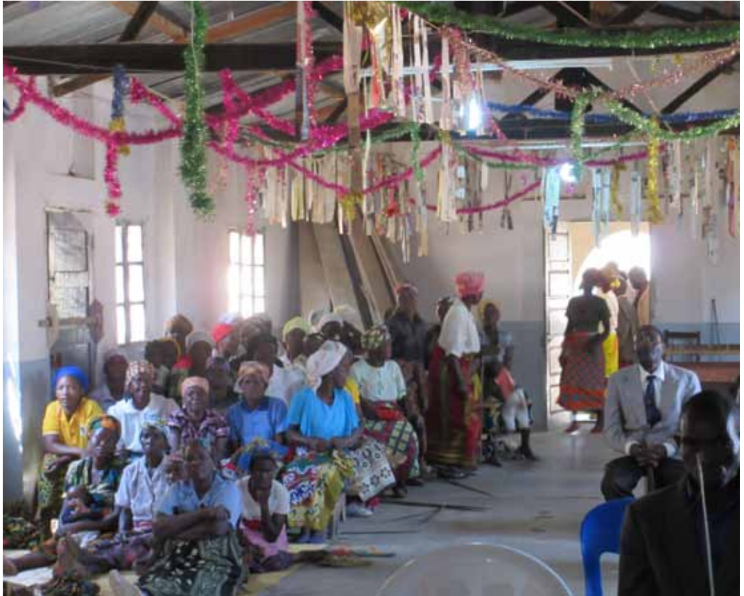
Christian worship in Mozambique (see page 5)