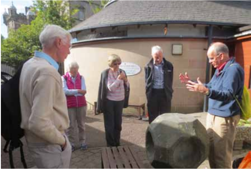
above: Sundials Walk, below: High Street Walk