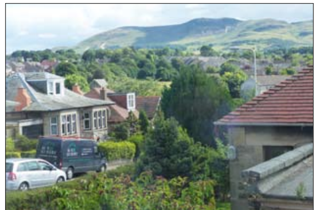
View of the Pentland Hills from the Manse

There is a single car brick built Garage with electric light and power, attached to the south gable elevation. The garage also has connection to water. There is further off-street car parking.