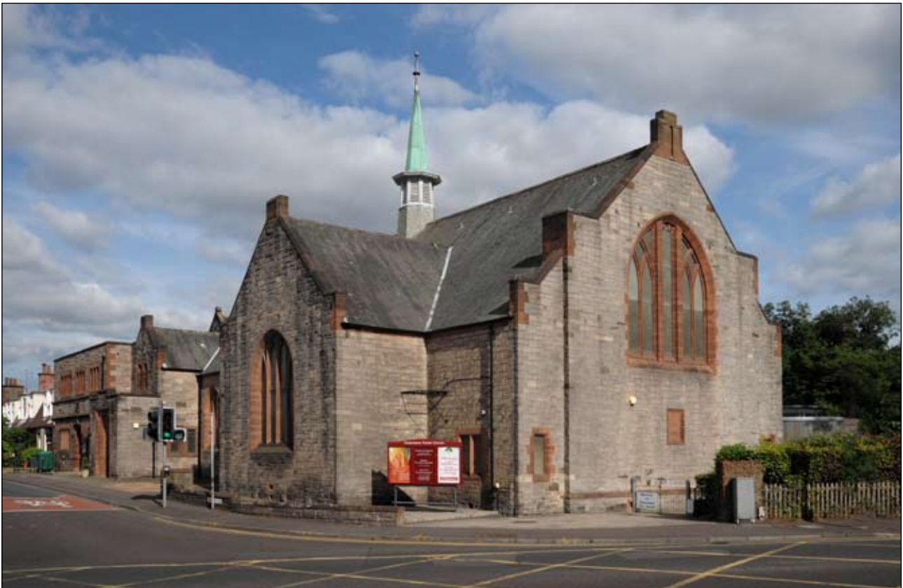
Greenbank Parish Church, Edinburgh – on the corner of Braidburn Terrace and Comiston Road