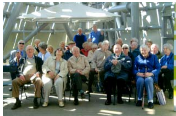
Friendship Club outing to the Kelpies

We run organisations for people of various ages, and provide accommodation for others. We have an active Guild with about 40 members, from our own congregation and outside. The Friendship Club for older people also has members who are not in the Congregation. The Work Party makes and supplies clothes for children to the Edinburgh Clothing Store and ERI baby unit. There are also our