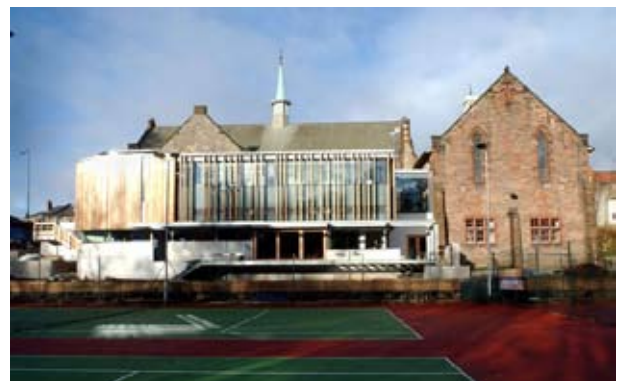
Rear of the church and halls