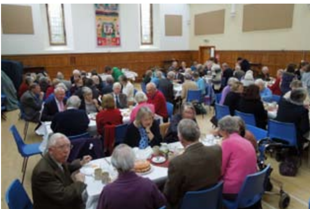
Sunday lunch in the Main Hall