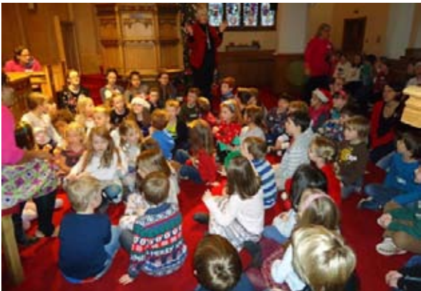
Christmas Event for Children

for primary school aged children. These can attract between 60 and 100 children.