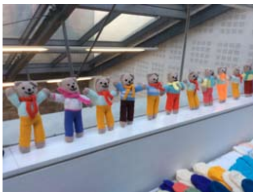
Trauma teddies, knitted by the Work Party

For many years ladies (and a few men) in Greenbank have been knitting and crocheting for charities. At the moment there are about twelve very friendly crafters who work away at home and get together on Thursday afternoons at 2.30pm at the church for a wee devotional, tea, and cake as we hand in completed work and collect new material for future projects. The group knits children's jumpers and cardigans for the Edinburgh Clothing Store and a church at Muirhouse, twiddle muffs