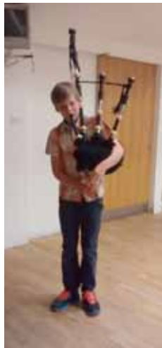
Preparing to perform at the Ceilidh