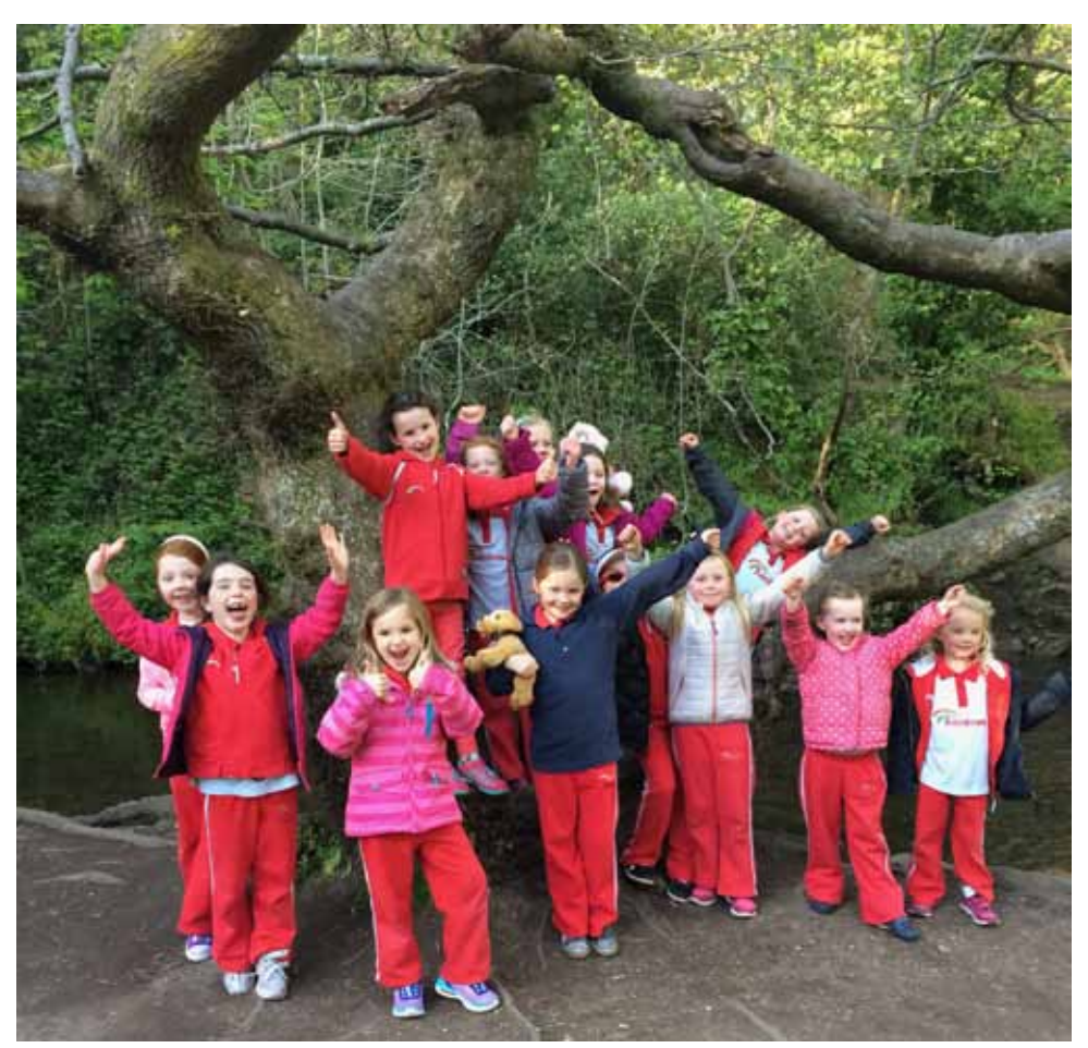
Greenbank Rainbows; see also page 11