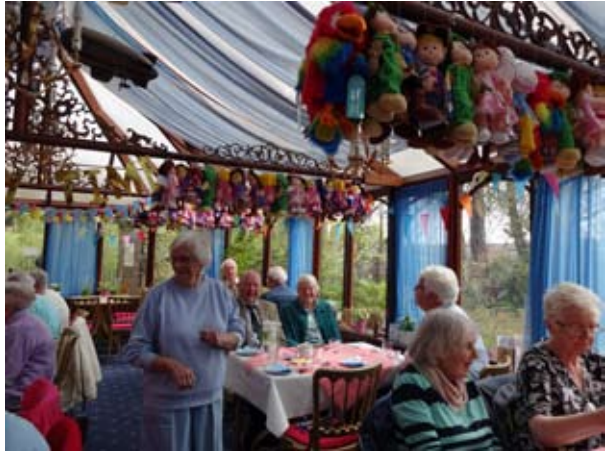
A Summer Outing