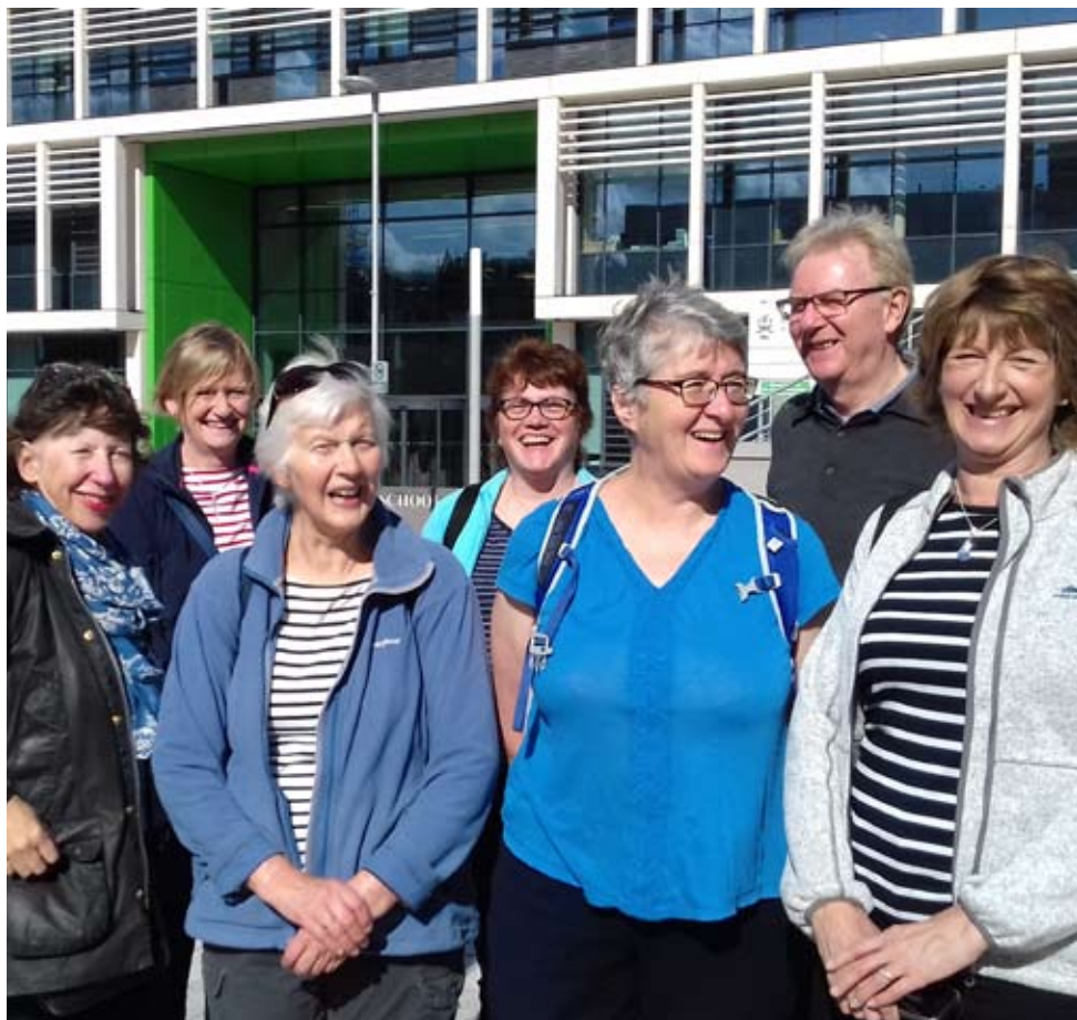
A YACHT walk along the Union Canal (outside the new Boroughmuir High School), August 2018