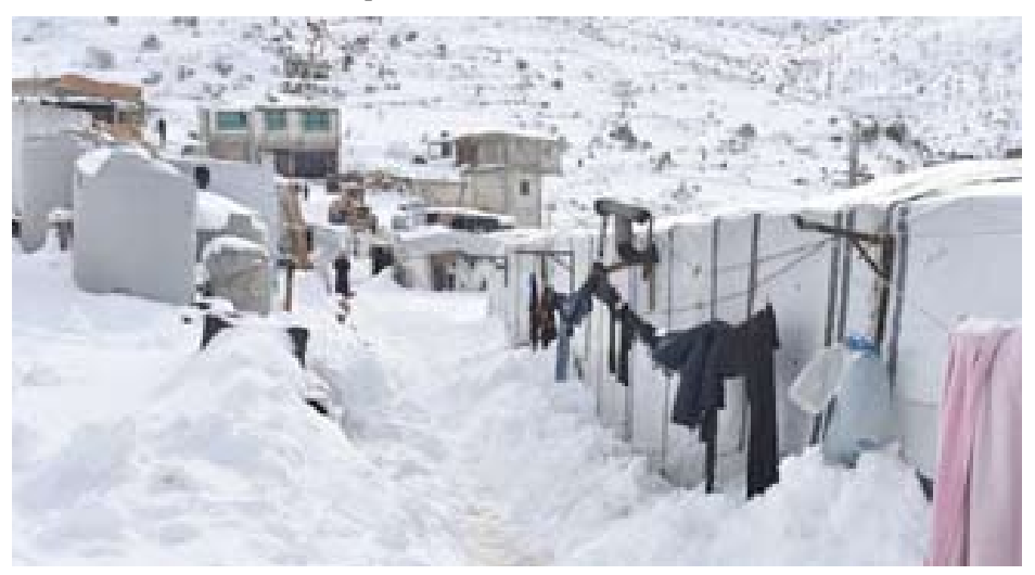
Arsal after Storm Norma, before Storm Miriam