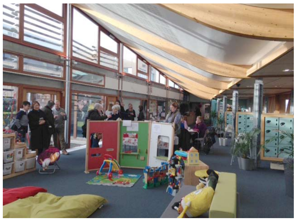
Children's play area, HMP Edinburgh Prison Visitor Centre

Many children are well known to the staff and are happy to stay and play while their adults go into the prison itself. Consequently, one of the staff said they were able to personalise the Christmas gifts which they received from the gift collections. Popular items were Lego, dolls, craft kits, books, board games but clearly the staff