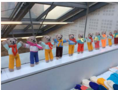
Trauma teddies, knitted by the Work Party

For many years ladies (and a few men) in Greenbank have been knitting and crocheting for charities. At the moment there are about twelve very friendly crafters who work away at home and get together on Thursday afternoons at 2.30pm at the church for a wee devotional, tea, and cake as we hand in completed work and collect new material for future projects. The group knits children's jumpers and cardigans for the Edinburgh Clothing Store and a church at Muirhouse, twiddle muffs