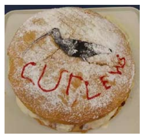
See 'Men Baking' article (opposite)