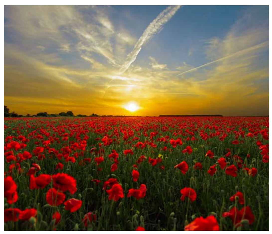
10th November is Remembrance Sunday; see also p.9.