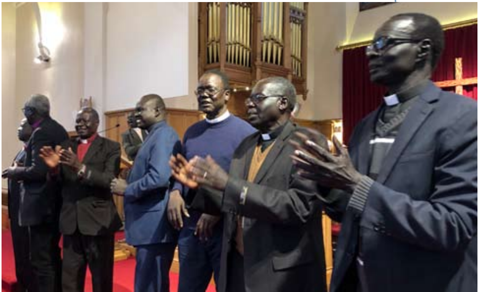
Sunday 3rd November 2019: our visitors from the Presbyterian Church of South Sudan