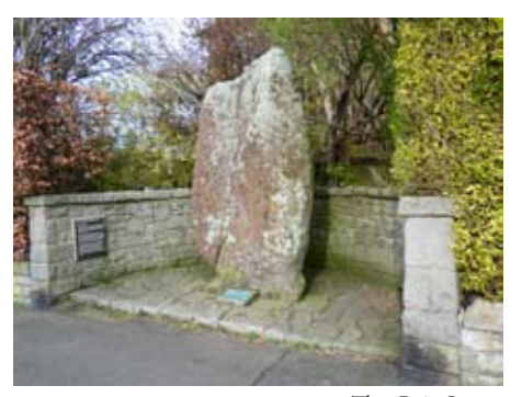
The Caiy Stane