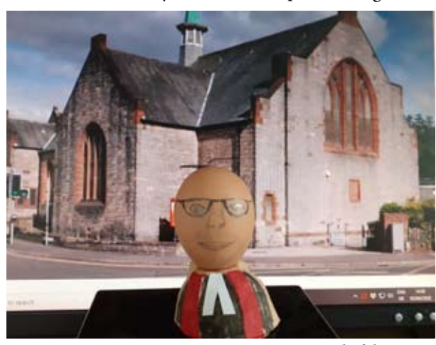
Our Wonderful Minister See p5: 'Lockdown Life' competition photograph

God remembers. It is the remembering by God of creation and of humanity that gives hope. At a time when we are threatened by a tsunami of disease, a flood of despair, and a seemingly relentless outpouring of bad news, this is why the rainbow is such a powerful symbol of hope in God, the One who not only remembers us but has experienced our life in its entirety.