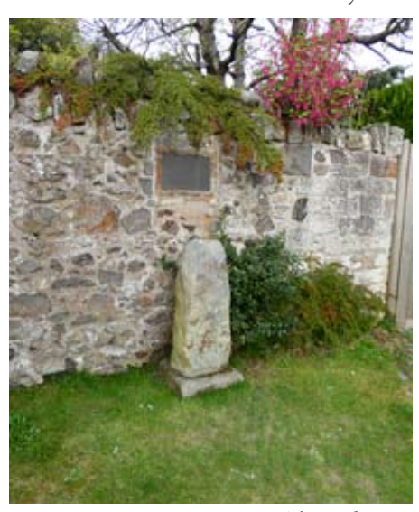
The Buck Stane