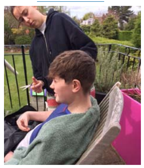
The Haircut: would you trust your sister? See p5: 'Lockdown Life' competition photograph