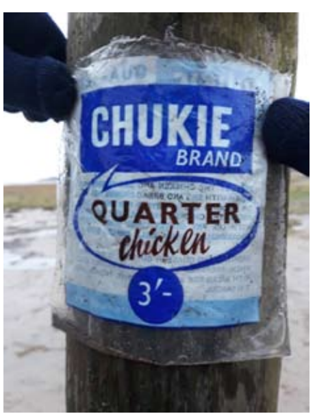
This plastic packet was found on the beach while walking. It's a TV snack of a quarter chicken which then cost the equivalent of 15 pence. This well-preserved state shows how well plastic packaging lasts after 50 years at sea or in sand; cooking instructions are supplied on the back.