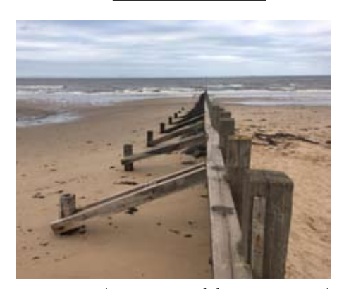
(See Running Club – opposite page) One of our members ran to Portobello