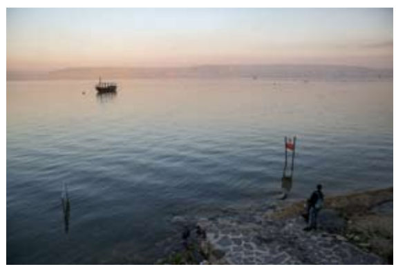
The Sea of Galilee

Getting to know more about the realities of life on the ground for Israelis and Palestinians alongside tracing the footsteps of Jesus and thinking ourselves into his world, were what motivated us at Greenbank to develop the idea of a pilgrimage in autumn 2021. We