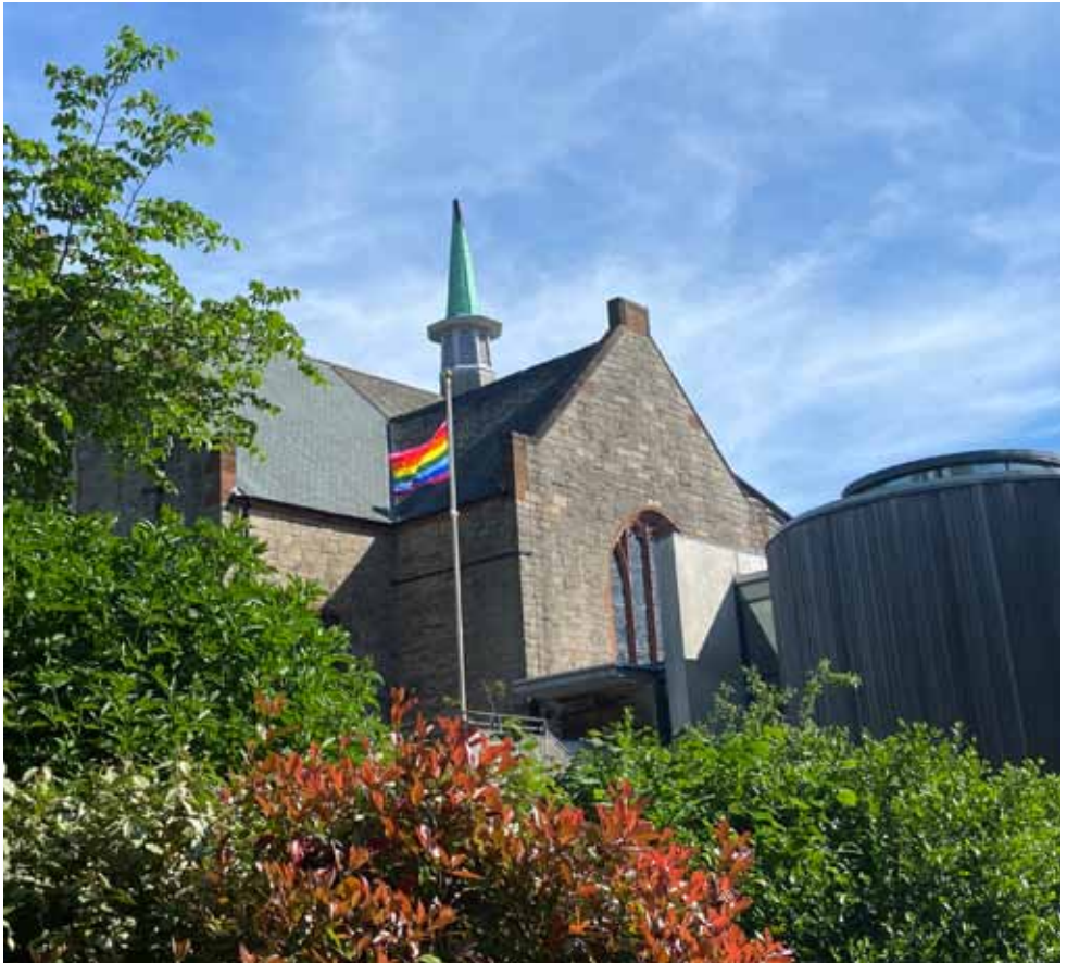
Greenbank flies its Rainbow Flag