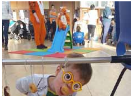
Hallowe'en at Toddlers →