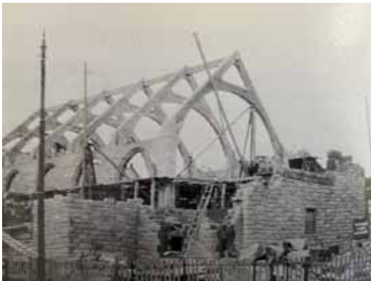
From the Archive: the innovative concrete structure for the new church 1927