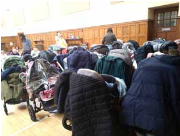
Buggy Jam on a rainy day