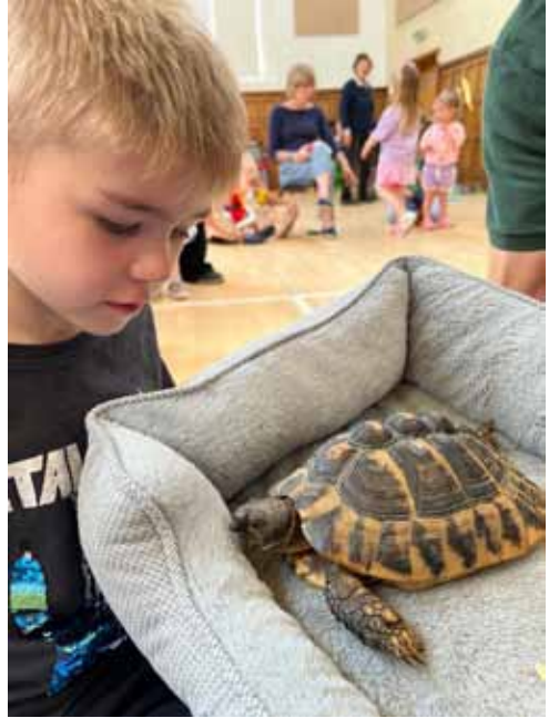
Mini-zoo came to Toddlers

All children up to school age are welcome with their parents or carers. Please come along and join us!