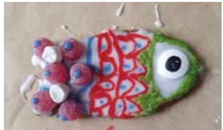
One of the fish biscuits from Holiday Club