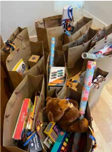
Above, packs ready to go Left, loading up for an Open Hand distribution