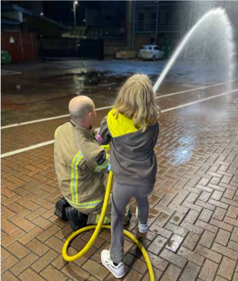
A Greenbank Brownie learning to fight fire (see article p18)