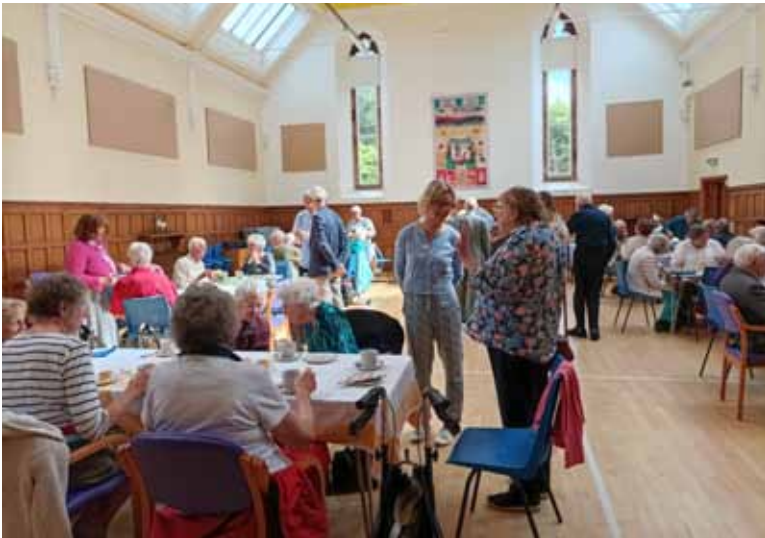
Afternoon tea after the service