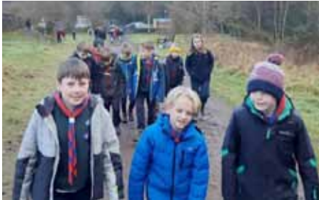
Cub Scout Hike

The Cubs (aged 8-10½) meet on a Thursday from 6.30pm to 8pm and enjoyed a busy year learning new skills and having fun. They focused on practical skills such as emergency first aid, knots and pioneering, and photography. Recent activities included the Gang Show, local hikes, and working on the swimming, pioneering badges, and Adventure Challenge Award. Also, a weekend at Bonaly in February allowed Cubs the chance to stay overnight, learn new skills and have a good time.