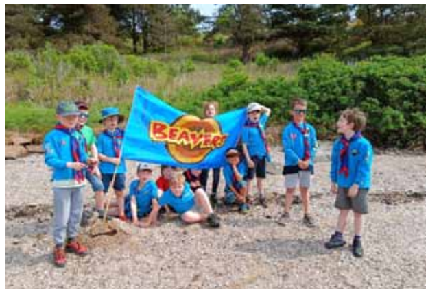
Beavers at Cramond

The Beavers (aged 6-8) have had a full-on year with lots of outdoor activities that have introduced the young girls and boys to Scouting. Recent activities have included a visit to Cramond island, the South Queensferry Lifeboat station, covering the My Person Challenge Award, and an exciting visit to a robotics lab.