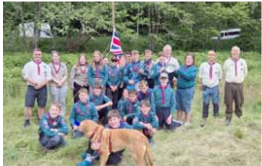
Scout Summer Camp

The Scouts meet on a Friday night from 7.15pm to 9.15pm and recent meetings have included Scout Skills, games, a visit to the Gang Show, guest speakers, volunteering in the Braidburn Valley Park, and focusing on the World Challenge Award.