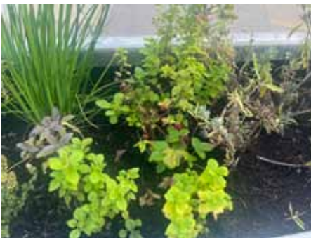
Herbs in one of the Eco-Group's new Planters