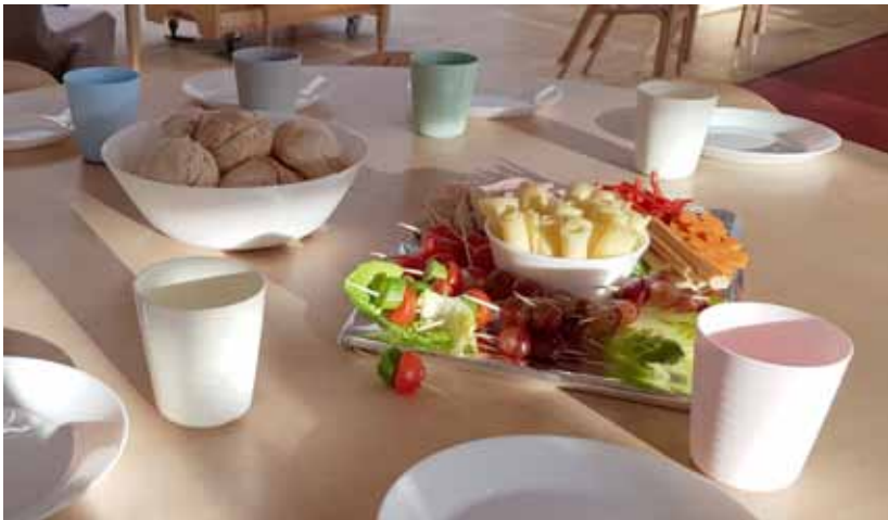
Pre-School Friday café style lunch