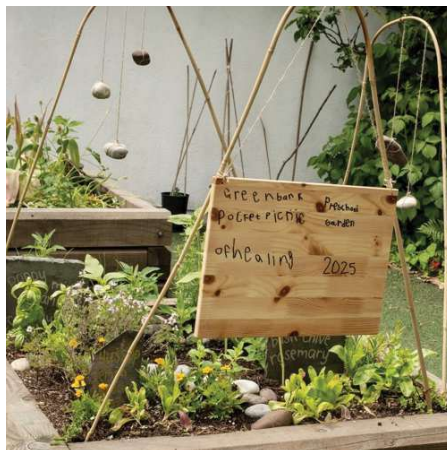
The pocket picnic garden as it looked in June

a Pocket Garden Design winners' certificate. The pocket garden supplies food and shelter for pollinators and other minibeasts. Food we grow will be enjoyed by the children.