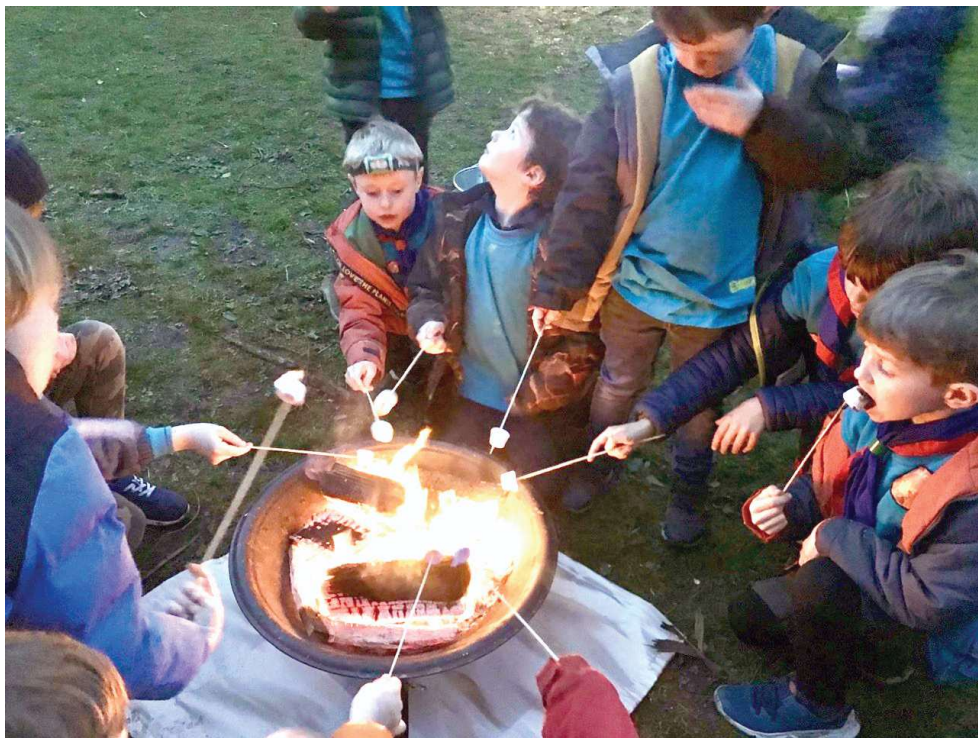
Greenbank Beavers see "Scouting at Greenbank" p16