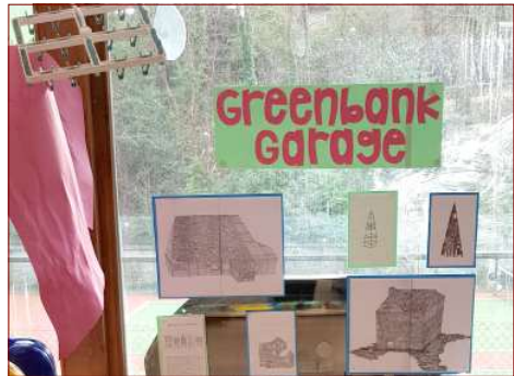
Displays in Pre School