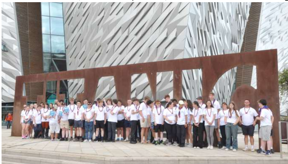
Explorer Scouts at the Titanic Exhibition

The Scout Troop (aged 10½-14) has also been busy, meeting on Friday nights between 7.15pm and 9.15pm. Activities included home skills, Scout skills, cycling, hiking, volunteering in Braidburn Valley Park, visiting the Gang Show, teambuilding challenges, kayaking and the Global Issues badge. There was an October weekend near Crieff, an indoor winter camp near Forfar, two ski weekends at Glenshee, Spring Camp near Callander, May Camp activity weekend at Fordell Firs, and our traditional week-long