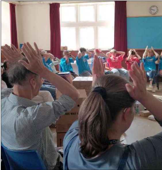
Rehearsing the action song at the volunteers' morning meeting