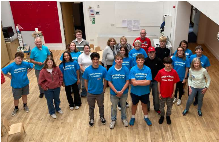
Some of the Volunteers