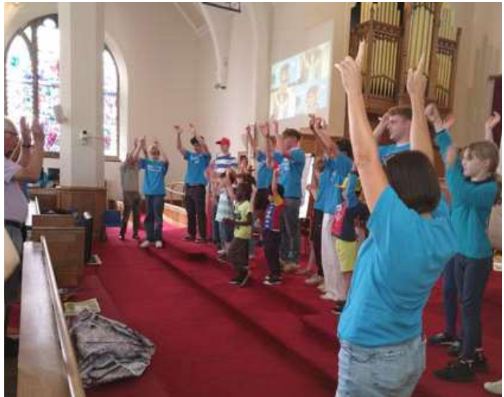
Action Songs in the church