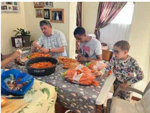
Making Carrot Soup