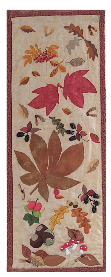
The Autumn Banners currently hanging in the Church