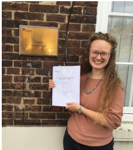
The subject: Music in Conflict: Contemporary Concepts of Classical Music in the Musico-Literary Novel