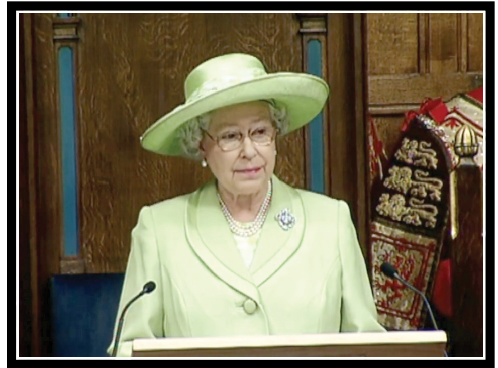
HM Queen Elizabeth II addressing the General Assembly of the Church of Scotland in 2002