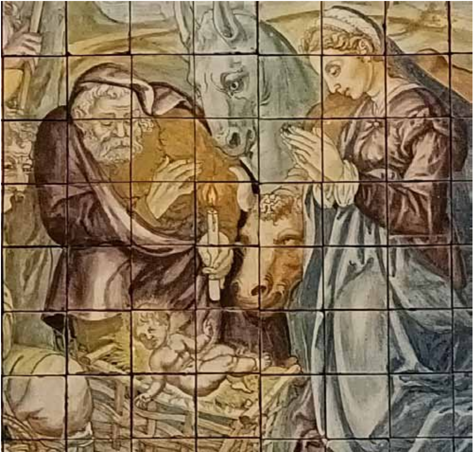
The Light of the World (see p6)