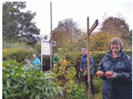
The Eco-Group had a very wet day for their end-of-season tidy-up