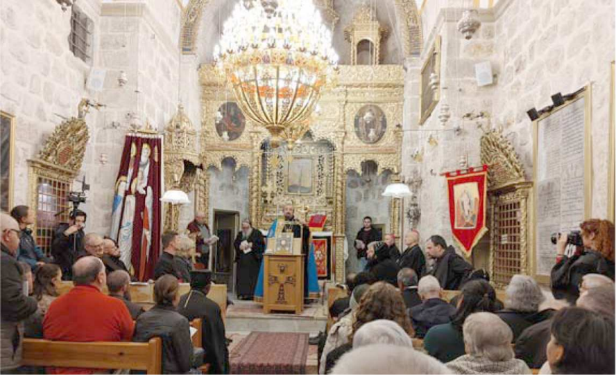
St Mark's Syrian Orthodox Church, Old City, Jerusalem, during the Week of Prayers for Christian Unity 2023

that I live in a sacred space, and not just a site of struggle.