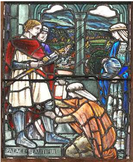
Palace Beautiful no 6