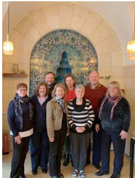
Kirk Session, St Andrew's Jerusalem & Tiberias

The full letter can be found at: tinyurl.com/meh6zzcc