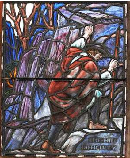
The Hill of Difficulty, no 5