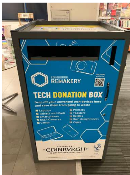
The box in Morningside library. Note that all items must fit through the slot.