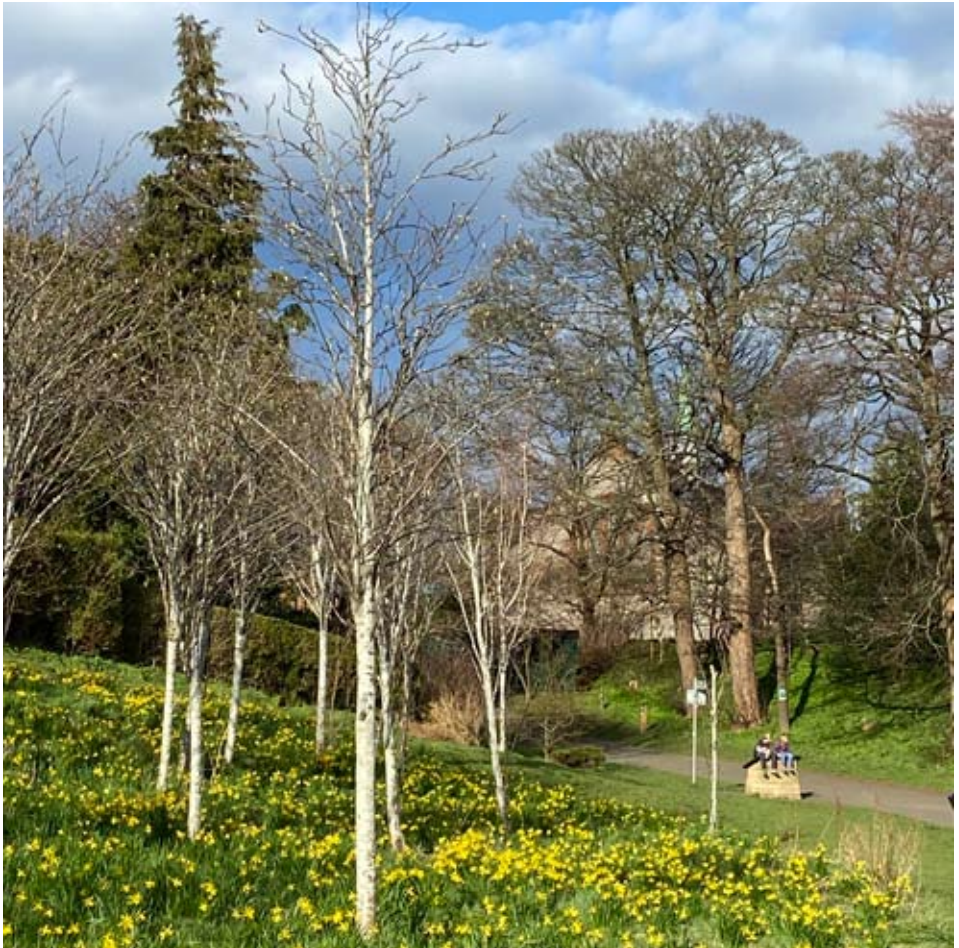
Springtime in Braidburn Valley Park