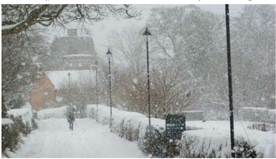
Rosslyn Chapel