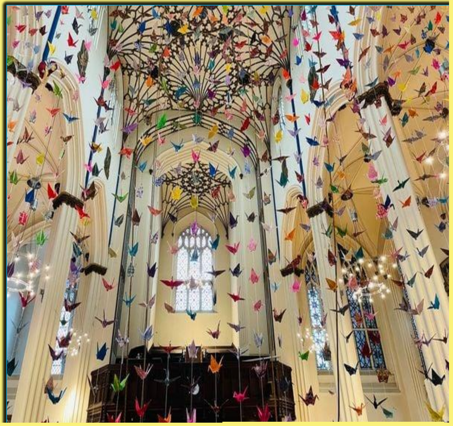
Peace Cranes Exhibition at St John's Church, Princes